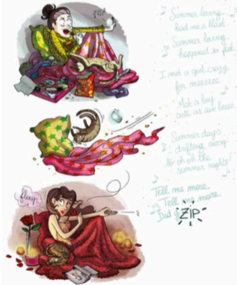
Quand j'avais rien de prévu ce soir et qu'il me dit "j'arrive"